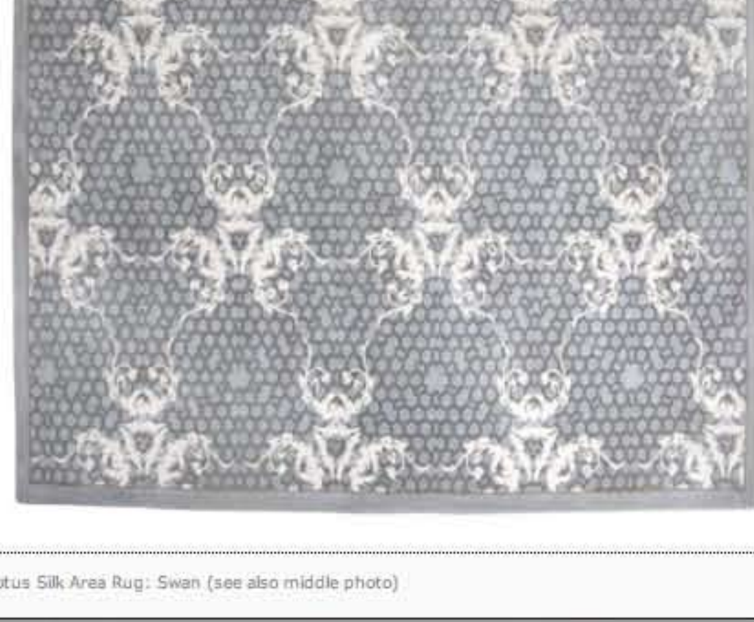
Lotus Silk Area Rug: Swan (see also middle photo)