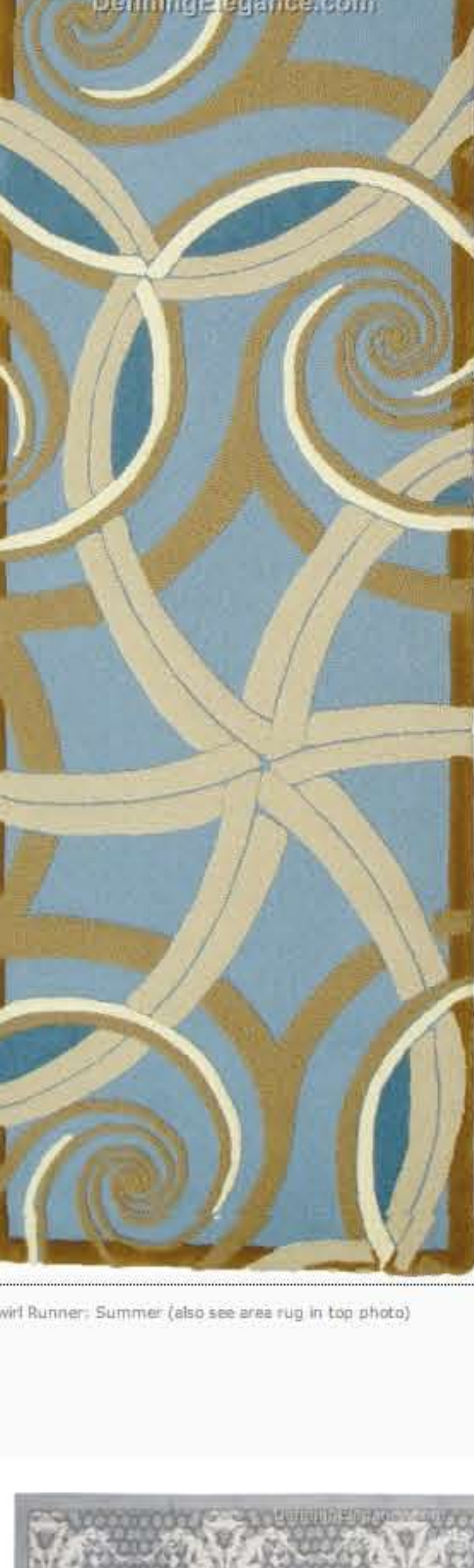
Swirl Runner: Summer (also see area rug in top photo)