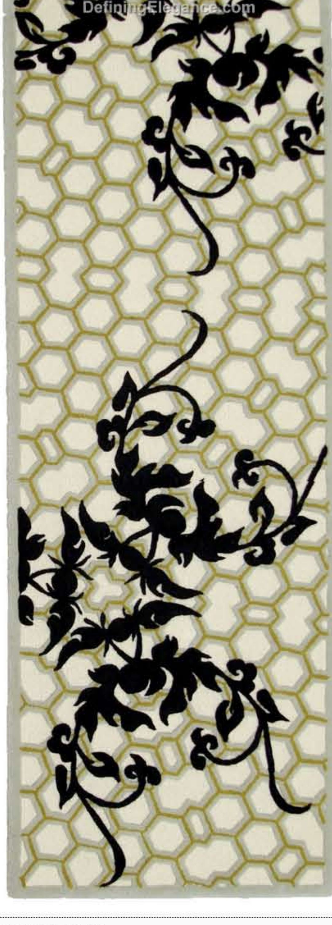
Lotus Runner: Danish Morning