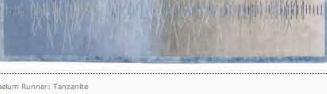
Caelum Runner: Tanzanite