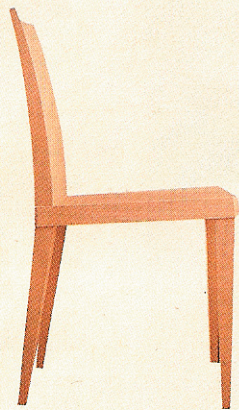
ARJA 34" high x 17" wide x 16" deep. $480. Mobili De Angelis; 973-744-2447, mobilideangelis.com.