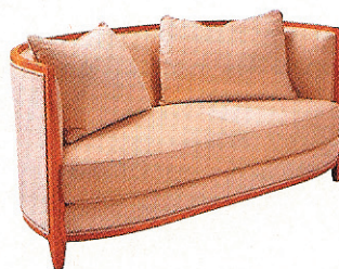
LOVE SEAT #F473 34" high x 70" wide x 41" deep. $7,740. Swaim Furniture; 336-885-6131, swaim-inc.com.