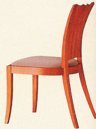
ARIA 36" high x 19" wide x 24" deep. $1,650. Thos. Moser; 800-862-1973, thosmoser.com.