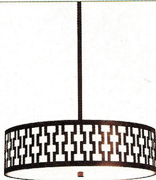
KYOTO 7½" high x 26¾" diameter. $4,675. Boyd Lighting Company; 866-251-7777, boydlighting.com.