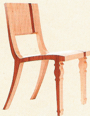
SIDE CHAIR 32" high x 18" wide x 21½" deep. $1,078. Context Furniture; 248-200-0724, contextfurniture.com.