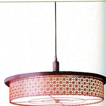
CUBANO 6" high x 20" diameter. $1,700. Donovan Design; 631-283-8175, donovandesign.com.